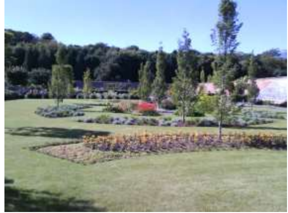
Some images of the Walled Garden