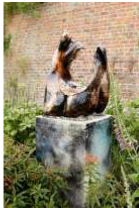
Some sculptures from previous years of ForM Sculpture Exhibition.