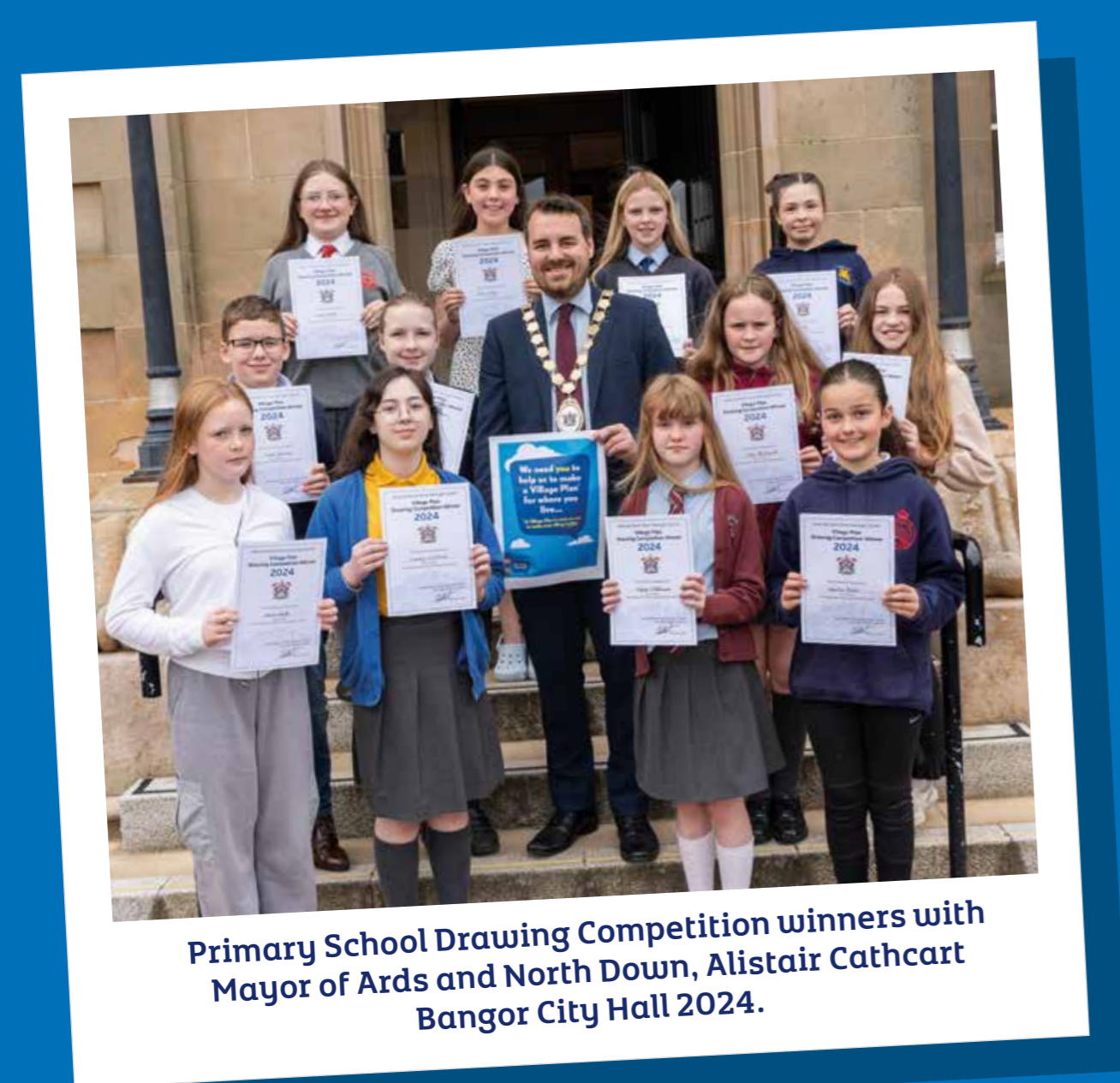
Primary School Drawing Competition winners with Mayor of Ards and North Down, Alistair Cathcart Bangor City Hall 2024.

The engagement process was designed to gather a diverse range of input through various methods, including public workshops, involvement of community groups and local schools, engagement at public events, on-street surveys and online surveys. This approach helped to ensure all members of the community were provided an opportunity to share their views.