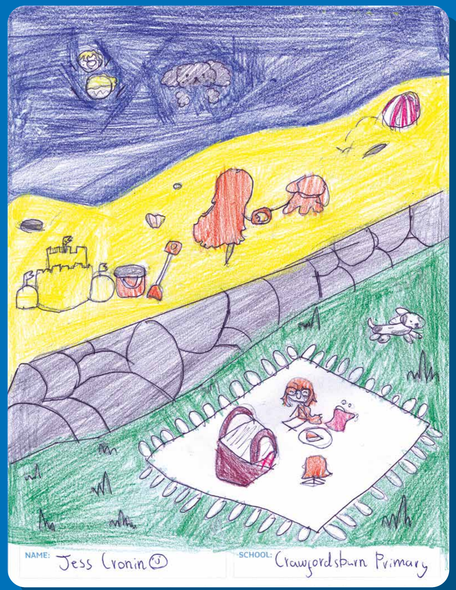
Crawfordsburn Primary School – Competition Winner “Draw what you think makes your village the best”

The young people expressed concerns about the narrow roads and the dangerous parking on either side of the road within the villages. They also stated that there were maintenance issues outlining overflowing bins and excess dog waste.