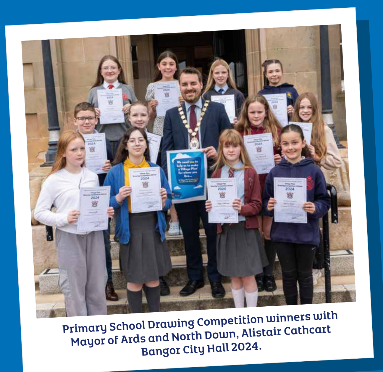
Primary School Drawing Competition winners with Mayor of Ards and North Down, Alistair Cathcart Bangor City Hall 2024.

The engagement process was designed to gather a diverse range of input through various methods, including public workshops, involvement of community groups and local schools, engagement at public events, on-street surveys and online surveys. This approach helped to ensure all members of the community were provided an opportunity to share their views.