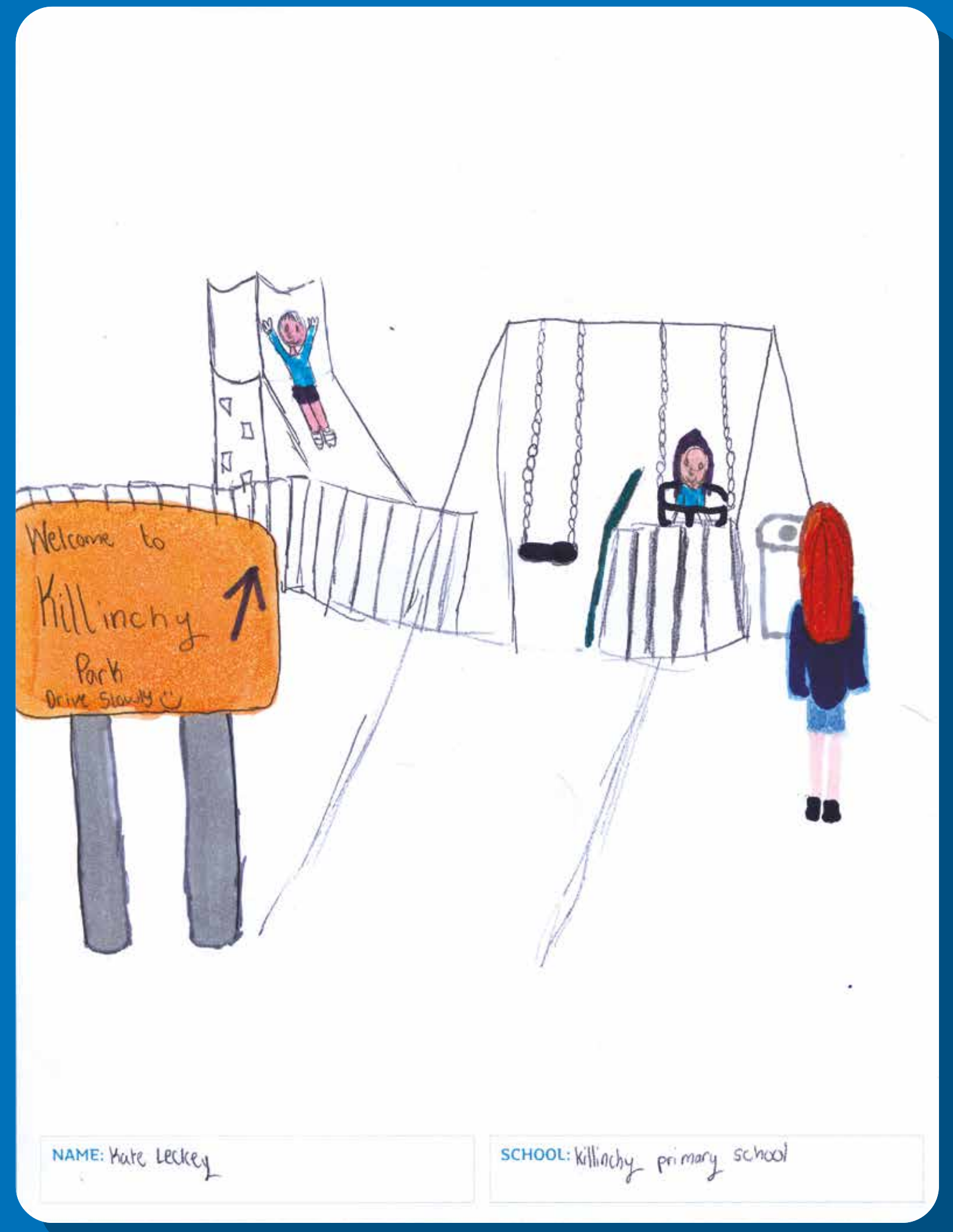
Killinchy Primary School – Competition Winner “Draw what you think makes your village the best”

The main concern raised by young people in Killinchy was issues around the play park and the football pitch. Mainly, the young people raised that there are holes and bumps in the football pitch, making it difficult to play safely. The young people also identified lack of safe pedestrian crossings along the roads, potholes and overgrown grass as concerns.