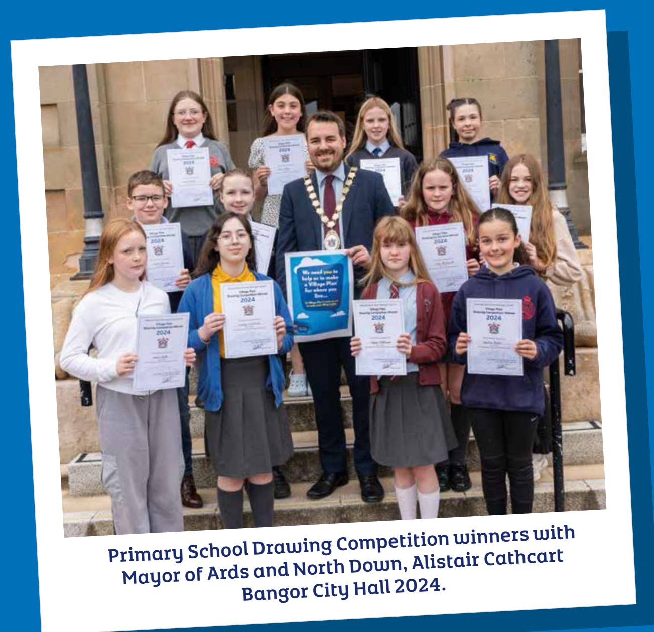
Primary School Drawing Competition winners with Mayor of Ards and North Down, Alistair Cathcart Bangor City Hall 2024.

The engagement process was designed to gather a diverse range of input through various methods, including public workshops, involvement of community groups and local schools, engagement at public events, on-street surveys and online surveys. This approach helped to ensure all members of the community were provided an opportunity to share their views.