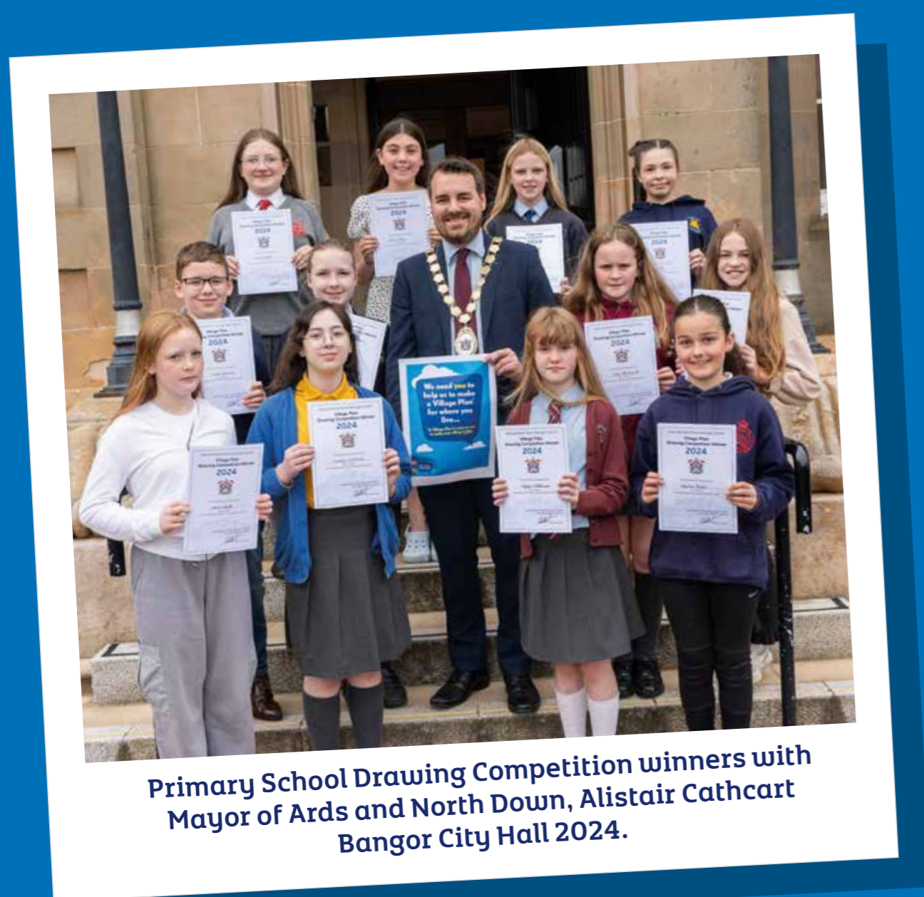
Primary School Drawing Competition winners with Mayor of Ards and North Down, Alistair Cathcart Bangor City Hall 2024.

The engagement process was designed to gather a diverse range of input through various methods, including public workshops, involvement of community groups and local schools, engagement at public events, on-street surveys and online surveys. This approach helped to ensure all members of the community were provided an opportunity to share their views.