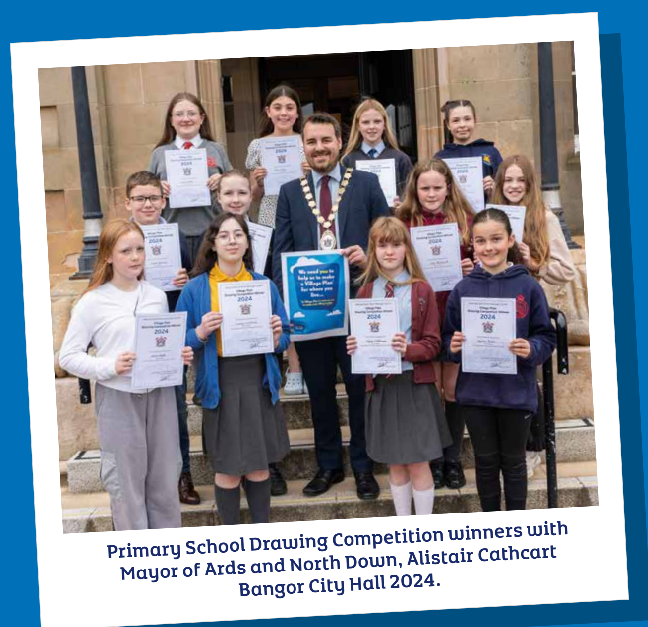
Primary School Drawing Competition winners with Mayor of Ards and North Down, Alistair Cathcart Bangor City Hall 2024.

The engagement process was designed to gather a diverse range of input through various methods, including public workshops, involvement of community groups and local schools, engagement at public events, on-street surveys and online surveys. This approach helped to ensure all members of the community were provided an opportunity to share their views.